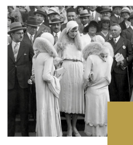
Flamboyant shaped the the Golden